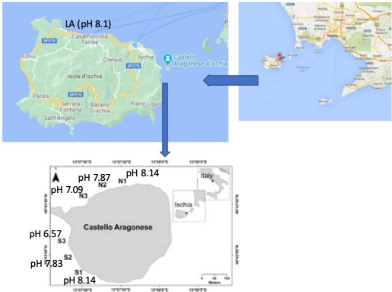
Figure 1. Study area. LA, Lacco Ameno Lacco d'Ischia.

control area in a zone far from the CO 2 vents, located in Lacco Ameno d'Ischia (LA in Fig.1)